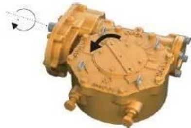
④ Left Hand Input CW in- CCW out Assembly position "D"