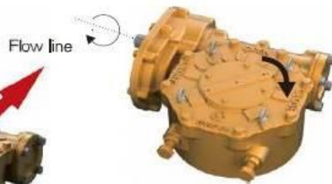
③ Left Hand Input CW in- CW out is most standard Assembly position "C"