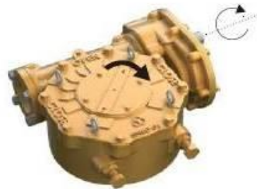
① Right Hand Input CW in- CW out is most standard Assembly position "A"