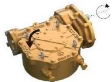
② Right Hand Input CW in- CCW out Assembly position "B"